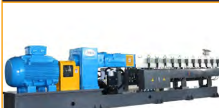
ADVANCE TWIN EXTRUDER