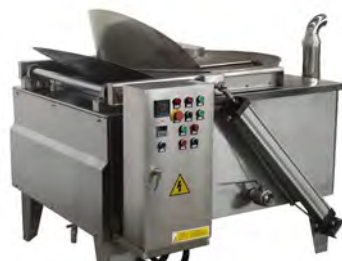
SEMI AUTOMATIC BATCH FRYER